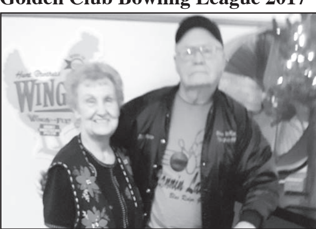
Golden Club Bowling League 2017 High Average Winners (L-R):